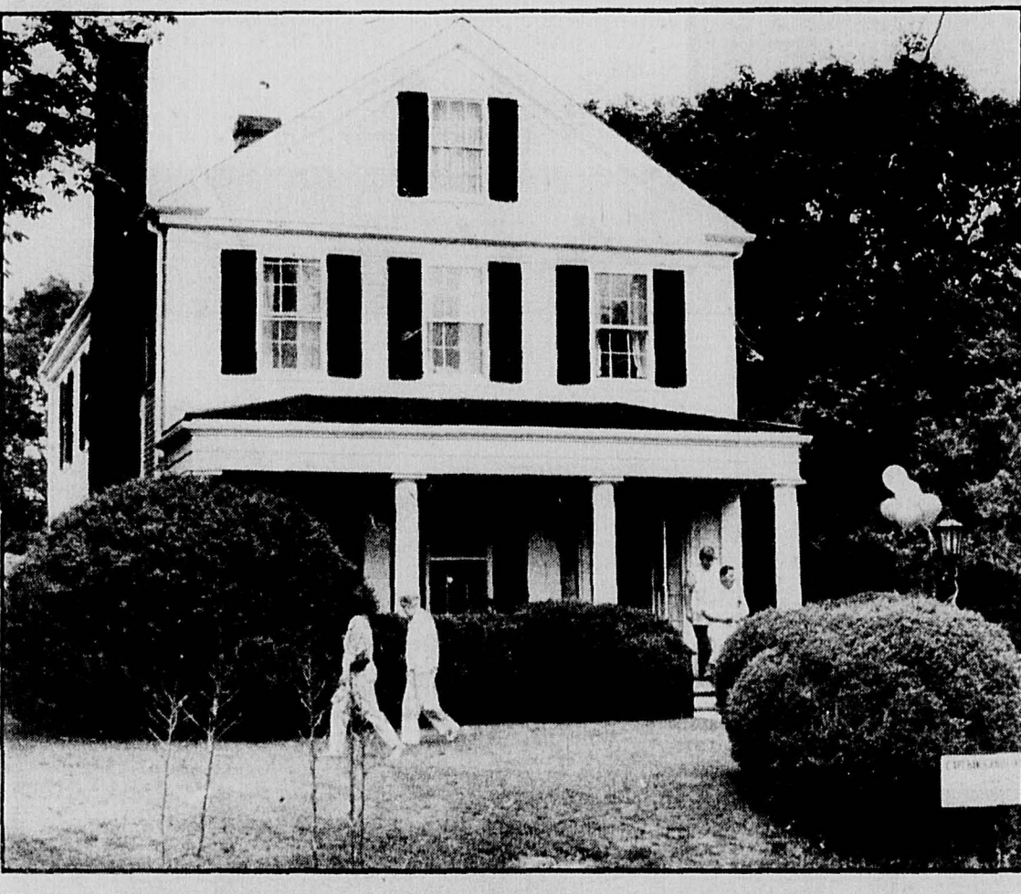
Guests mill around Bangs Hallet House during July 24 open house

'A Map of Busy Life, Its Fluctuations and Its Vast Concerns'