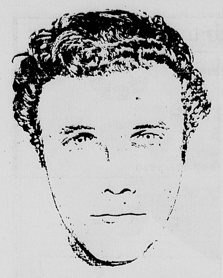
Police sketch of suspect "in museum two days before theft acting very suspicious"