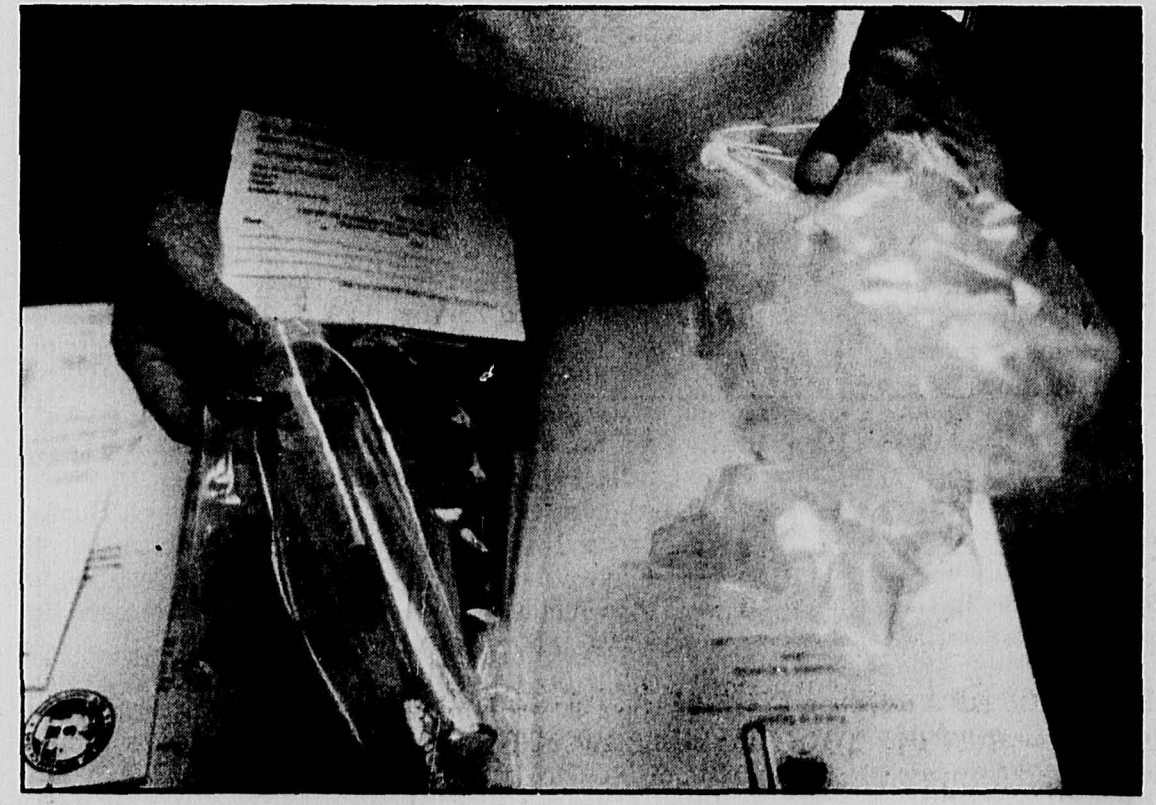
Syringes: hospital waste, or a diabetic could have dropped them

The state agency issued an advisory about medical waste July 22, noting the amounts found so far are small. In fact, false alarms outnumber valid reports. According to the advisory, some of the supposed medical waste reported to the state has turned out to be cheese wrappers, parts of fireworks, and a panty liner.