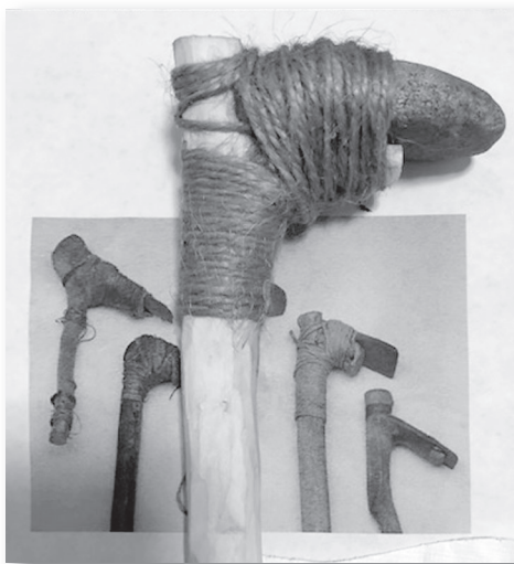
Representation of how the miniature stone adze may have been hafted.