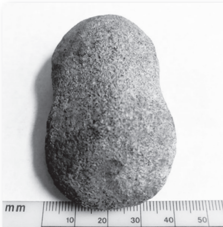
This miniature stone adze dates to 3500BP and is believed to be a toy.